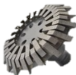
STEP 2, 3